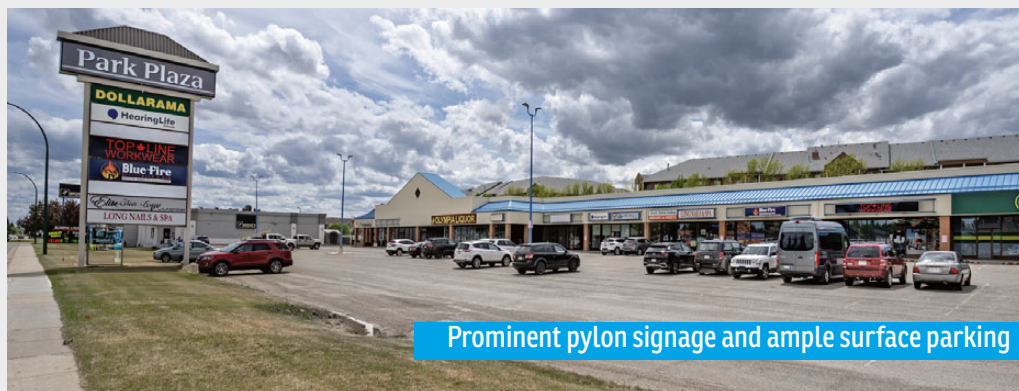
Prominent pylon signage and ample surface parking